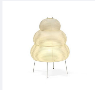
Lot 61030807: Isamu Noguchi - Vitra Floorlamp

In 2023, homes will be filled with pieces that contribute towards a serene living environment. Softer edges and unconventional shapes are showing up in cosy interiors. Collections of minerals and vintage tarot cards give each space an ethereal touch, while analogue hobbies are embraced as opportunities to unplug.