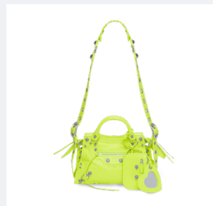
Lot 35930395: Balenciaga - City Bag