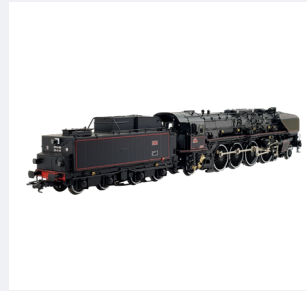
Lot 56862493: Märklin HO - Steam Locomotive with Tender