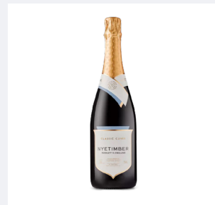
Lot 26286611: Nyetimber "Classic Cuvée" Brut - West Sussex