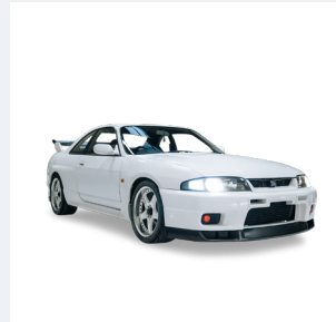
Lot 43705705: Skyline Gt-R 33, 1996

The Office for National Statistics in the UK shows that consumers between 25-35 now have the highest median disposable income and they keep coming back to the era that signified their youth – the noughties. Welcome the return of glittery fashion, flashy cars and memorabilia that signal the dawn of the digital age. For cars, take a cue from movies such as Fast & Furious and Need for Speed. Plug in the PlayStation, grab your Pokémon cards and your Balenciaga City bag for a thoroughly-Y2K night.