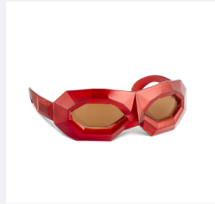
Lot 46247317: Walter Van Beirendonck - Sunglasses

Forget the rules, 2023 will be the time to express individual style. Design and art for 2023 comes in a myriad of styles and mediums – an A.I. generated portrait on the wall, a large statement piece by Sottsass or an abundance of home accessories. In fashion, clash prints and textures by combining Moschino with Margiela. Next year, it's time for people to make their own rules.