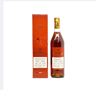
Lot 60591435: Cognac Jean Fillioux Wu Dram Clan - No. 55/60, Single Estate Single Cask Cognac - b. 2022 - 700ml