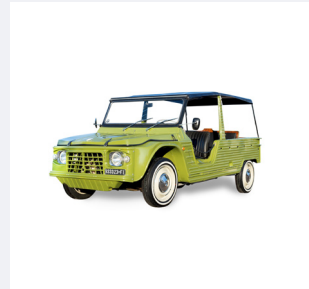
Lot 56818503: Citroën - Mehari Mk1, 1970s