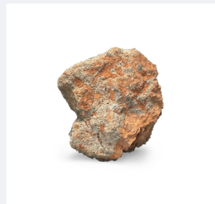
Lot 60624501: Moon Meteorite