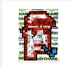
Lot 53057569: Moabit - Moabit X Crypto Punk X Blue Pipe