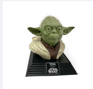
Lot 43288689: Star Wars Episode II: Attack of the Clones - Master Yoda - Bust