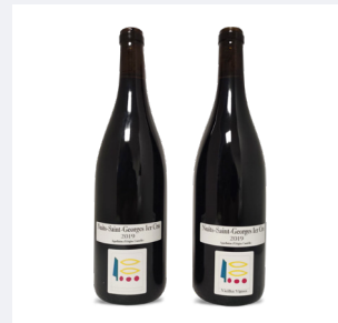
Lot 26286611: 2019 Domaine Prieure Roch - Nuits St. Georges 1er Cru - 2 Bottles

2023 will be a celebration of change with underrepresented faces taking centre stage – from sports heroes to newborn wine regions. Wine producers and distillers who are putting a new spin on long held traditions will become more present, while historically marginalised athletes are finally getting the recognition they deserve. 2023 is about more inclusive narratives and special objects that tell a story everyone can relate to.